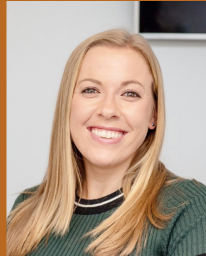
HANNAH COCKROFT OBE DL PARALYMPIC CHAMPION

The result of these events has been an increased engagement from Muslim, refugee, and ethnic minority communities at The Piece Hall and the ability to develop a more diverse and culturally aware programme that provides for the multicultural population living in Calderdale. We have been honoured to work with refugee communities living in Halifax and to establish focus groups that engage with people from different backgrounds which will help us to develop our offer further. We received an influx of positive feedback from the 2022 Eid celebration and the Ramadaan programme launched in 2023, projects we are planning to build upon in years to come.